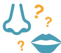
LOSS OF TASTE/SMELL