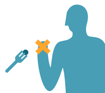
REFUSAL TO EAT