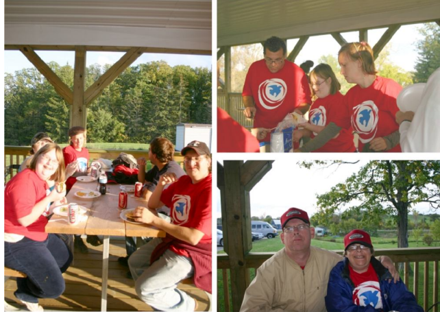
Celebratory Barbeque held to thank everyone for their hard work.