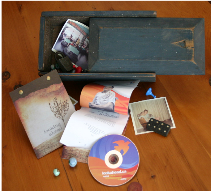
VIP Invitation Memory Box Package