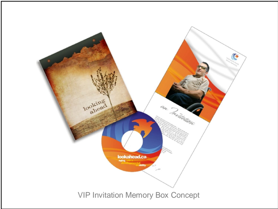
VIP Invitation Memory Box Concept