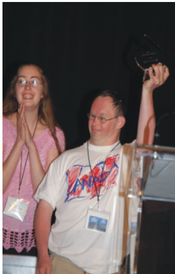
Kick-off raises $10,000 and wins Community Living Ontario Award for Innovation!